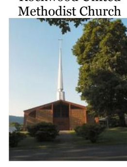
Rockwood United Methodist Church