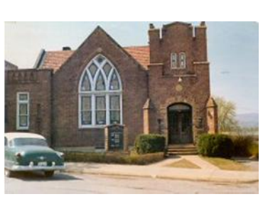
First Methodist Church